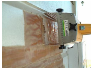
The Speedheater in action removing paint from weatherboards.

The Speedheater 1100 uses infrared heat to remove most kinds of paint and varnish. Infrared heat is a low tempera-