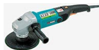
7" Rotary Disk Sander

Rotary disk sanders are used for quick removal of paint from uneven surfaces. These sanders are very aggressive and should be used with caution as surface can be easily damaged. You should also take caution when sand-