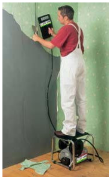
Kerr's easy to use Wallpaper Steamer

When renovating an old house quite often there are several layers of wall paper that need to be removed to prepare any wall surface for painting. The best method of removal is to use a wall paper steamer. These machines use a steam blast to get behind the paper and release the glue. Combined with a scraper, paper can be removed with ease. We recommend that you place a drop sheet down and place old towels rolled up at the bottom of wall. This will catch cooled water & prevent any damage to floors & carpets.