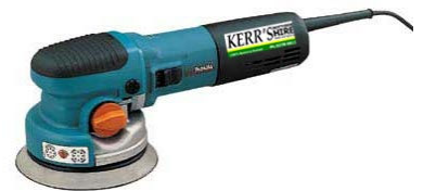
6" Random Orbital Sander

Kerr's Random Orbital Sander is perfect for sanding small or large timber surfaces. It features a 2-mode switch for "random orbit" action (finish sanding) and "random orbit with forced rotation" action (aggressive sanding and polishing). Sand paper grits available are 40, 80 & 120 grit.