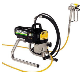
Kerr's new Wagner airless Spray

When it comes to painting some of the more difficult areas of your home. Eg. Fences, Doors or Rough surfaces, using spray painting machines is the only way to get a perfect finish and achieve it without the difficulty.